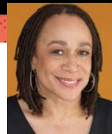
S. EPATHA MERKERSON