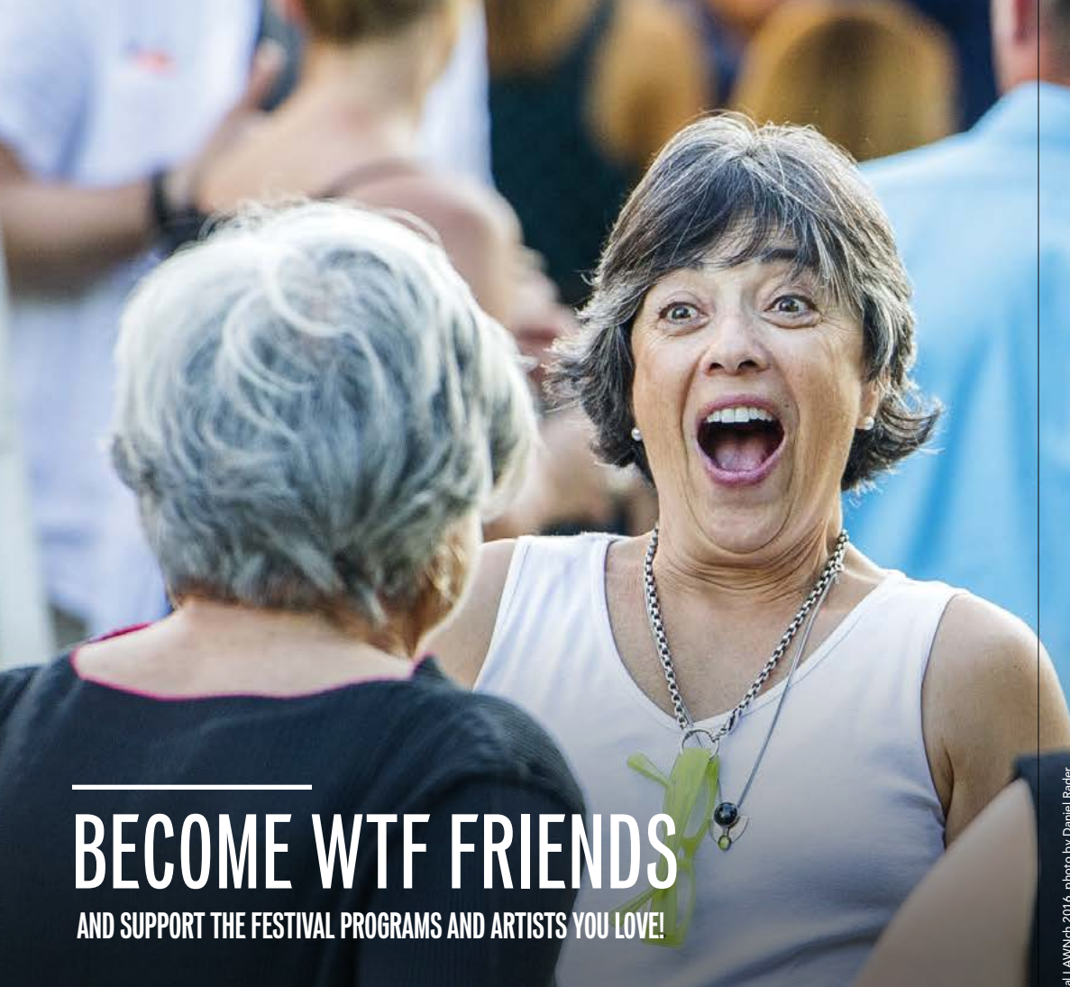
Festival LAWNch 2016