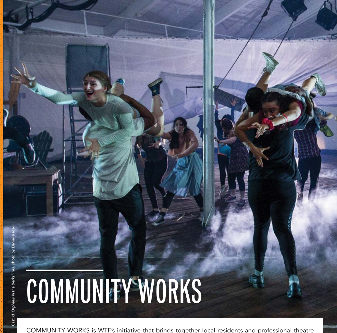
Cast of Orpheus in the Berkshires

See calendar on pages 17–20 for specific show dates and times