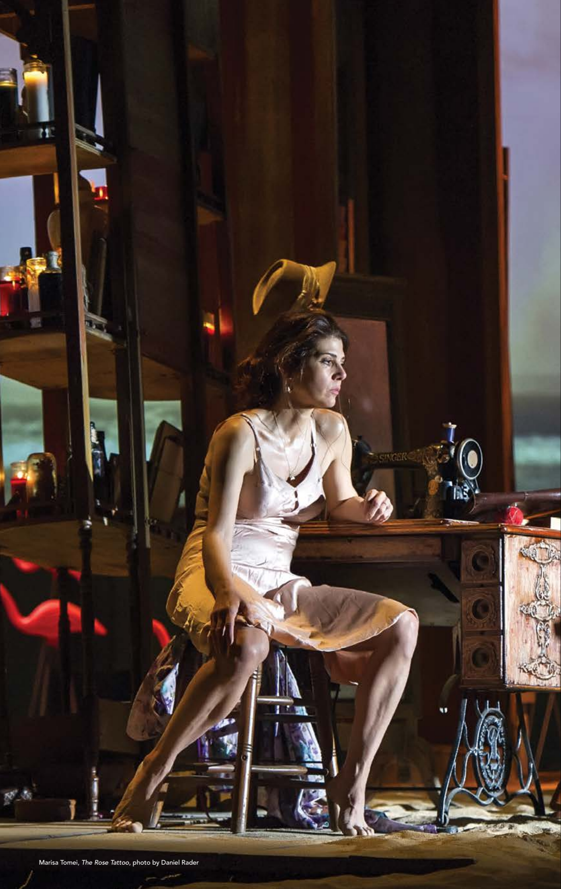
Marisa Tomei, The Rose Tattoo